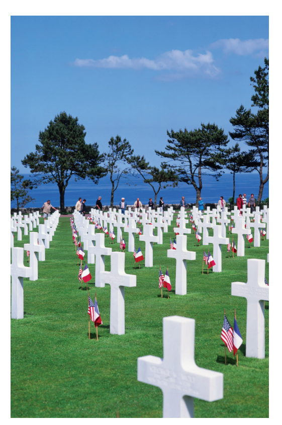
On Day 12, we visit the American Cemetery at Omaha Beach.