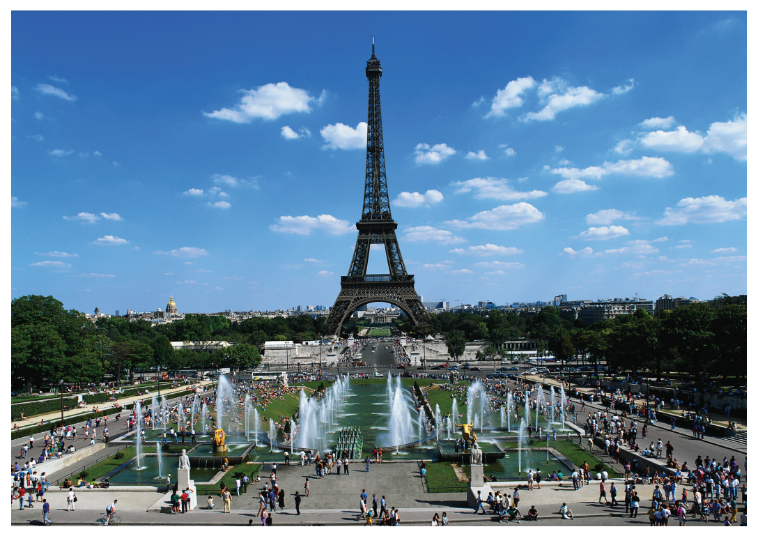
Discover Paris with its iconic Eiffel Tower.

some of Sarlat's museums or art galleries – or simply to wander the atmospheric cobblestone streets. After lunch on our own we visit nearby Rocamadour, a revered pilgrimage site and medieval village whose three tiers cling almost impossibly to a sheer limestone cliff. We take a guided walking tour then enjoy some free time before we return to Sarlat mid-afternoon and dine together tonight. B , D