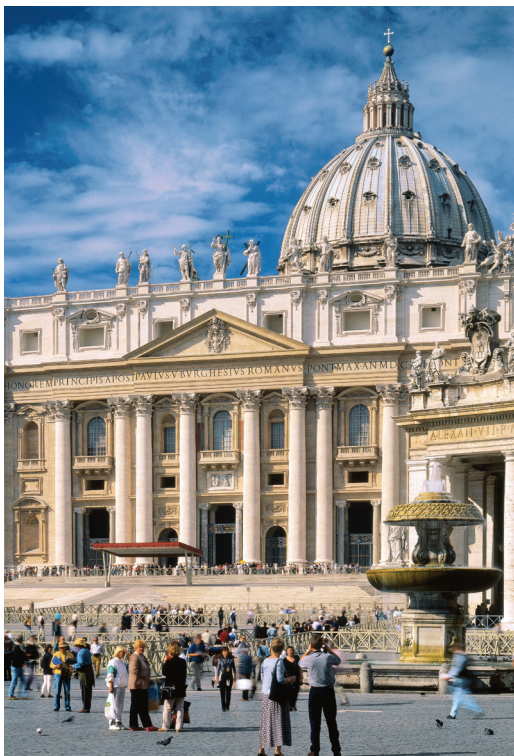
We visit St. Peter's Square and Basilica on Day 7.