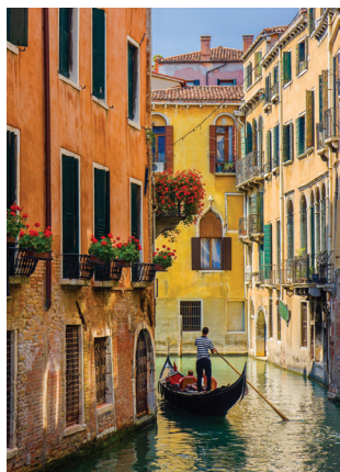
Our tour ends in timeless Venice.

Day 13: San Gimignano We encounter classic Tuscany today as we visit the hill town of San Gimignano, known for the 13 watchtowers that have left its skyline virtually unchanged since medieval times. Later we visit a local winery and enjoy a tasting before returning mid-afternoon to our lodgings, where we have time to relax before tonight's dinner at a local restaurant. B,D