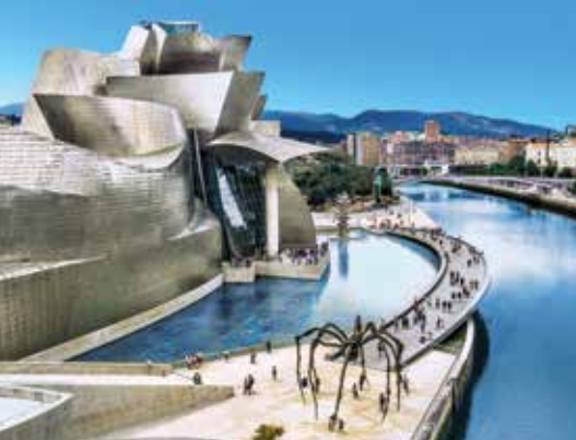
See Bilbao's avant-garde Guggenheim Museum, wrapped in shining waves of titanium.