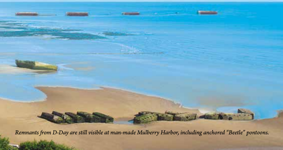
Remnants from D-Day are still visible at man-made Mulberry Harbor, including anchored "Beetle" pontoons.

AVAILABLE TO ALUMNI, THEIR FAMILIES AND FRIENDS