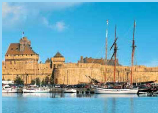
Anchor outside the historic 12 th -century walled city of Saint Malo, land of the notorious corsairs (privateers).

Enjoy a guided tour of the Guggenheim's renowned modern and contemporary art collection, explore the art nouveau and Baroque jewels of Bilbao's historic Casco Viejo and walk along the Paseo del Arenal, a promenade for Bilbaínos' leisurely evening strolls.