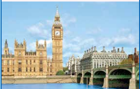
The Parliament, neighbored by 19 th -century Big Ben, was strategically built on the River Thames in 1016.

One of Europe's most visually appealing capitals, Lisbon seduces with its cinematic streetscapes, medieval passageways and timeless rituals. The legacy of Roman, Visigoth, Moorish and Christian rule is reflected in a cache of palaces, castles and churches crowning Lisbon's trademark hills. Overlording a forested village, Sintra's confection of turreted castles, mudéjar palaces, ancient hermitages and hills laced with exotic gardens has lured kings, queens, poets and composers since the Moorish occupation. Accommodations are for two nights in the deluxe DOM PEDRO LISBOA.