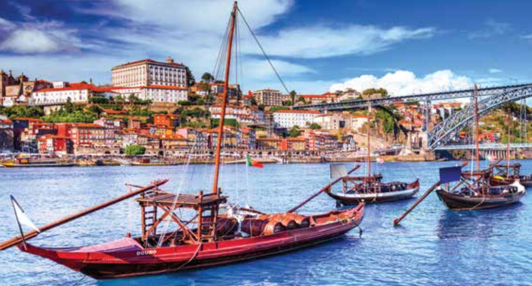
Flat-bottomed rabelo boats once transported casks of port wine along the Douro River to the lodges of Oporto.