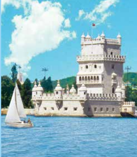
From the 16 th -century Tower of Belém in the Tejo Estuary, watchmen surveyed Lisbon's harbor.

buildings and magnificent arcaded squares grace Santiago de Compostela, a UNESCO World Heritage site and arguably Spain's most beautiful city. Stroll along medieval pedestrian stone streets to the expansive Plaza del Obradoiro flanked by the glorious Romanesque cathedral. A pilgrimage site since the Middle Ages and the final stop on the Camino de Santiago trail, the cathedral enshrines the tomb of St. James and is recognized for its intricately carved Baroque façade, original medieval portico and glittering Churrigueresque altar.