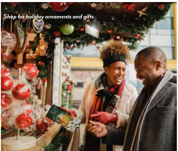
Shop for holiday ornaments and gifts