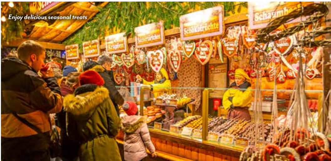
Enjoy delicious seasonal treats

Disembark the river boat this morning and transfer to the airport for a flight back to your home city. (B)