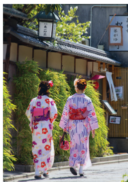
Geishas in traditional dress

Day 11: Kyoto More of Kyoto is on tap today, beginning with a visit to the otherworldly Arashiyama Bamboo Grove; the Kyoto Museum of Traditional Crafts (Fureaikan), showcasing all of Kyoto's 74 different métiers in one place; and Nijo-jo Castle (c. 1603), the extravagant residence and fortifications of the shoguns who ruled Japan for more than 250 years. Then the remainder of the day is free for independent exploration in this traditional, yet modern city before we gather for dinner together tonight. B,D