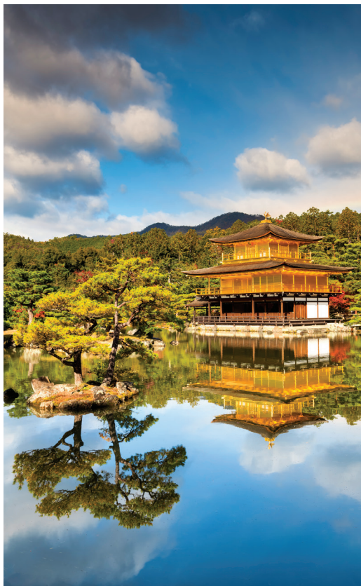
We visit Kyoto's Temple of the Golden Pavilion on Day 10.