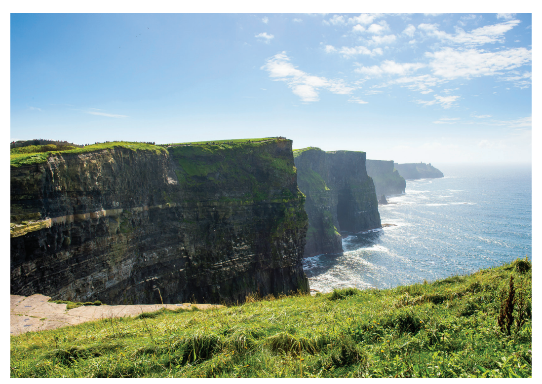
The sun shines down on the Cliffs of Moher, as we see on Day 7.

here, imparting local lore along the way. We stop at Dun Aenghus Fortress, the three prehistoric stone walls crowning the tallest cliffs of Inishmore; have lunch in a local pub; and enjoy some free time before returning to the mainland and our hotel late this afternoon. Dinner tonight is at a local restaurant in the village of Bearna. B , L , D