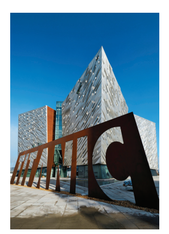
Titanic Museum, optional extension

Day 11: Kilkenny Today is devoted to Kilkenny, a well-preserved medieval city known as Ireland's cultural capital – and the country's smallest city. We tour 12<sup>th</sup>-century Kilkenny Castle, considered one of the country's most beautiful, then embark on an informal walking