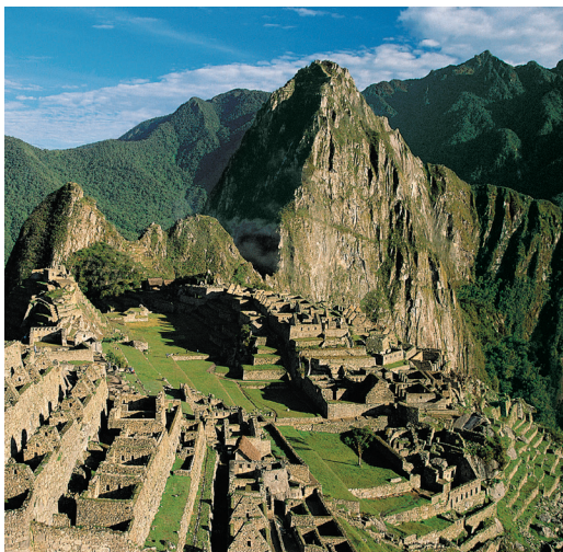
We explore the amazing ruins at Machu Picchu on Days 5 & 6.

Day 15: Quito/Depart for U.S. This morning we visit Quito’s Botanical Gardens and Ñaquito Market.