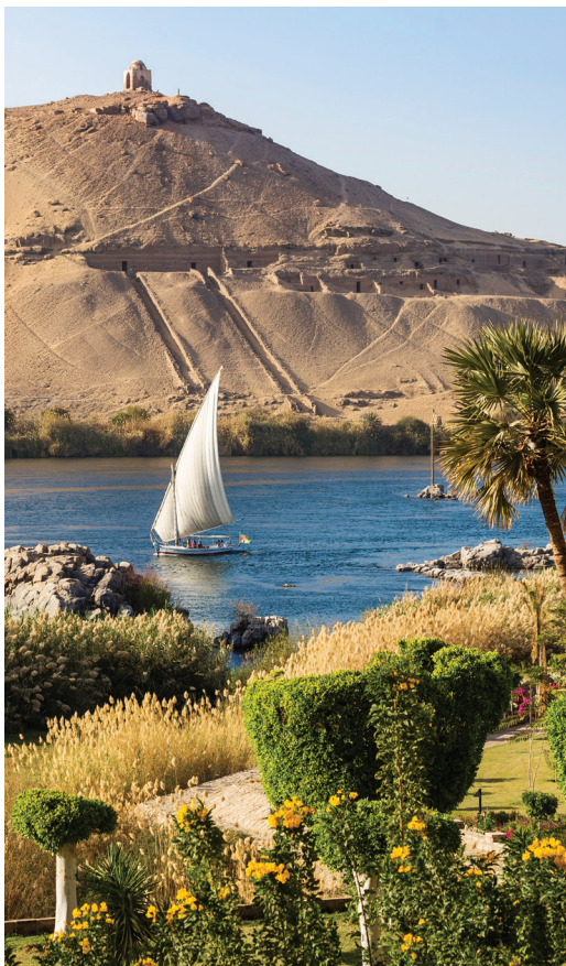
We sail traditional feluccas along the Nile.

Day 15: Depart for U.S. Very early this morning we transfer to the airport for our return flight to the U.S. B