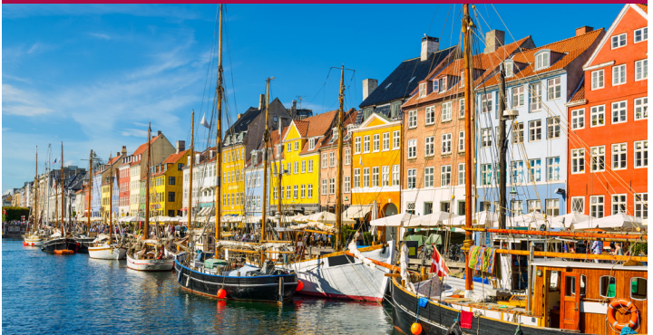
Norway and Copenhagen | 6 days, 5 nights Voss-to-Oslo Train | Oslo & Copenhagen Tours