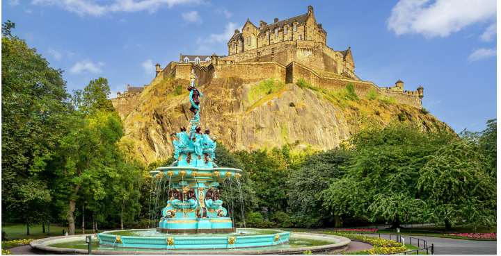
Edinburgh and Glasgow | 5 days, 4 nights Edinburgh & Stirling Castles | Glasgow