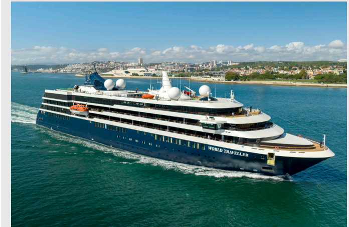
World Traveller Exclusively Chartered, Deluxe Small Ship