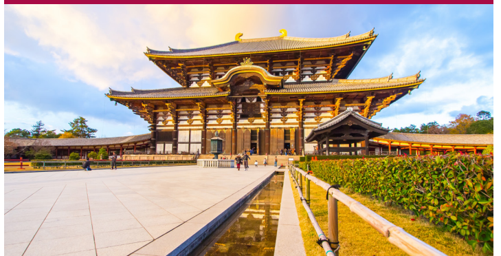
Osaka | 3 days, 2 nights Nara | Osaka City Tour

Gohagan & Company 8550 West Bryn Mawr Avenue Chicago, Illinois 60631