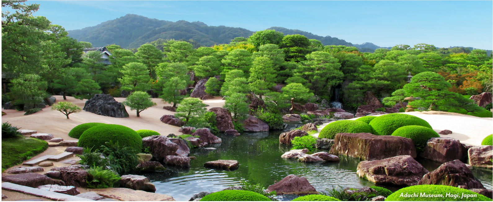
Adachi Museum, Hagi, Japan