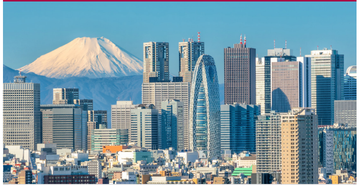
Tokyo | 5 days, 4 nights Senso-ji | Hakone | Tokyo National Museum