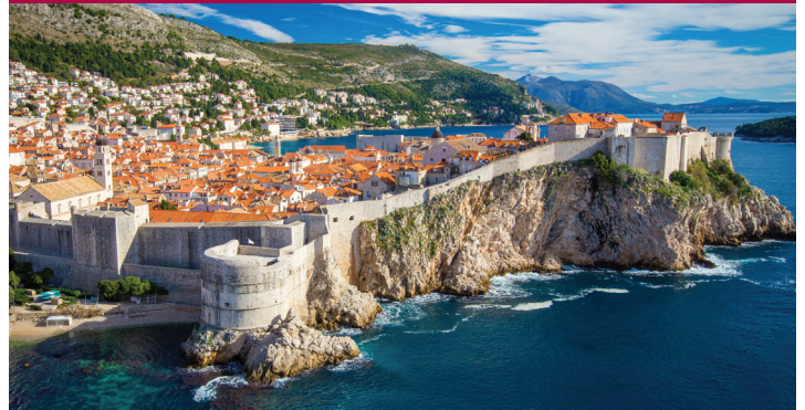
Dubrovnik | 4 days, 3 nights Old Town Tour | Traveler’s Choice Excursion