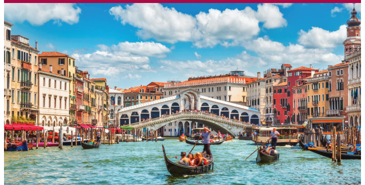
Venice | 3 days, 2 nights Venice Walking Tour | Gondola Ride | Burano