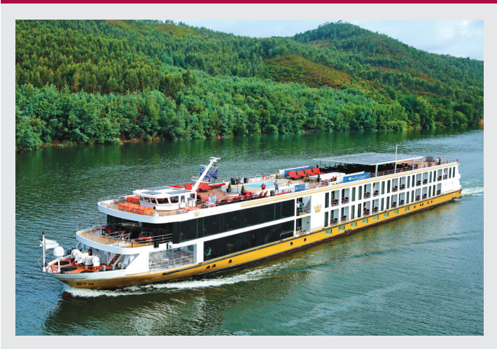
AmaVida Exclusively Chartered, Deluxe River Boat