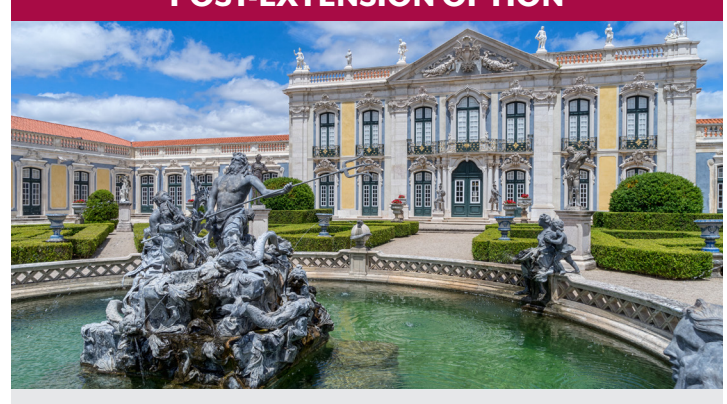
Lisbon | 4 days, 3 nights City Tour | Fado Performance | Queluz Palace

Gohagan & Company 8550 West Bryn Mawr Avenue, Suite 600 Chicago, Illinois 60631