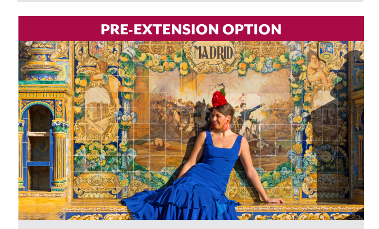
Madrid | 4 days, 3 nights Salamanca, Spain | Madrid City Tour