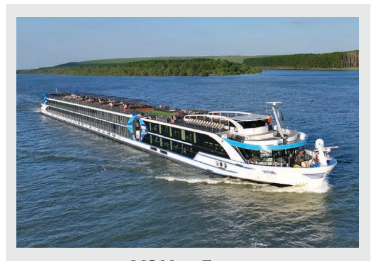
MS Viva Enjoy Exclusively Chartered, Deluxe Small Ship