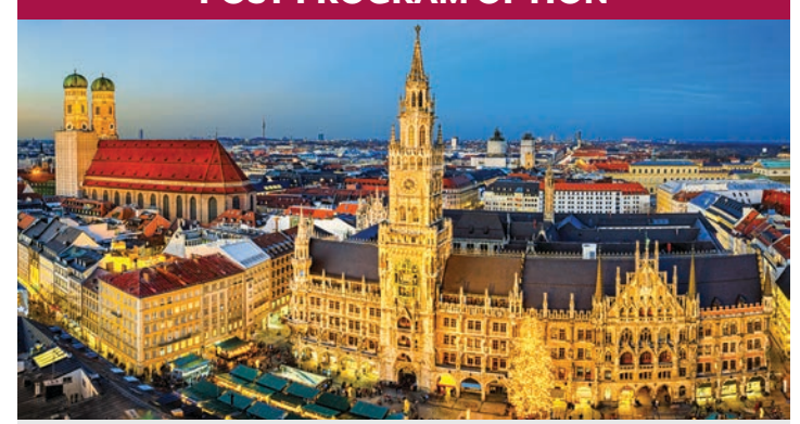
Munich | 4 days, 3 nights Romantic Road Towns | City Tour | Bavarian Palaces

Gohagan & Company 8550 West Bryn Mawr Avenue Chicago, Illinois 60631