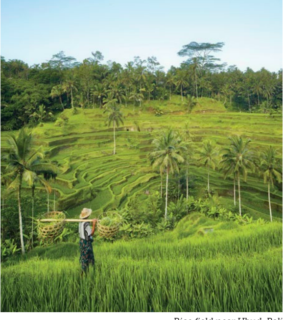
Rice field near Ubud, Bali

Join an enriching 12-night adventure to Southeast Asia, a land of stunning diversity. Begin in beautiful Bali, a treasure trove of cultural landmarks. Fly to Singapore and witness this modern city's fascinating attractions and neighborhoods. Unravel Bangkok's myriad layers found within its winding canals and opulent palaces and shrines. Venture beyond Bangkok to the early Siem capital of Ayutthaya before capping off the journey in Cambodia. Here, encounter the remarkable Angkor Wat and other ancient temples. Along the way, the region's welcoming locals share insights into their lives, cuisine and unique traditions.