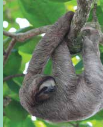
Look for the three-toed sloth, the world's slowest mammal.

groups of capuchin and howler monkeys, coatis, iguanas and more than 230 species of birds.