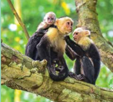
Seek out capuchin monkeys, known for their intelligent use of tools to forage for food.

Snorkel in its emerald waters, where schools of brilliantly colored fish, giant manta rays and four different species of turtles swim amid spectacular coral reefs.