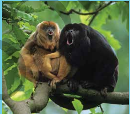
Listen for the whooping call of the howler monkey, which can be heard up to three miles away.

In nearby Casa Orquídeas, a stunning, maze-like botanical garden of over 100 species of orchids, bromeliads, heliconias and edible plants, look for colorful toucans, scarlet macaws and jewel-hued hummingbirds.