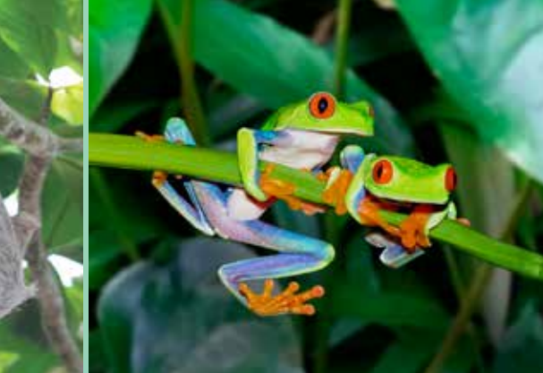
world's Search the rainforest for Costa Rica's iconic red-eyed tree frogs, who flash their eyes to distract predators.