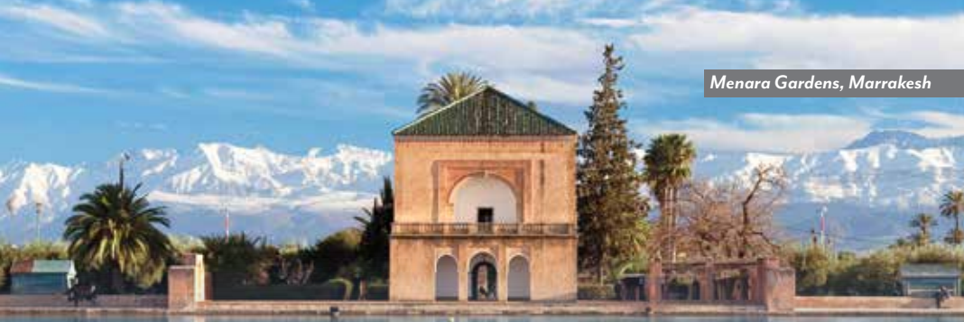
Menara Gardens, Marrakesh