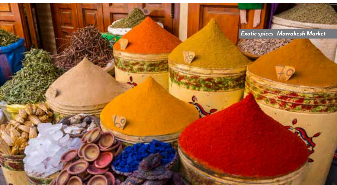
Exotic spices- Marrakesh Market