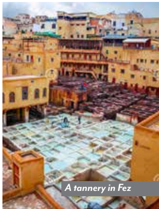
A tannery in Fez

Enjoy an afternoon at leisure to experience the captivating