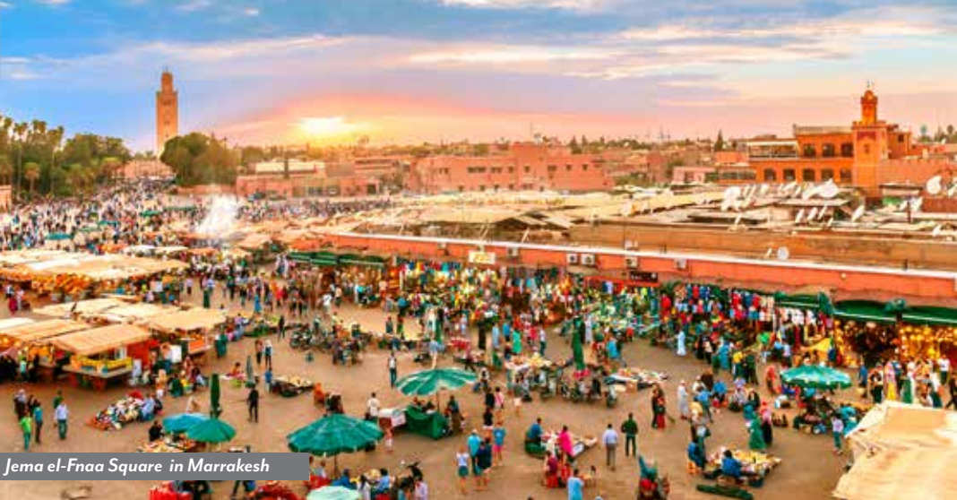
Jema el-Fnaa Square in Marrakesh